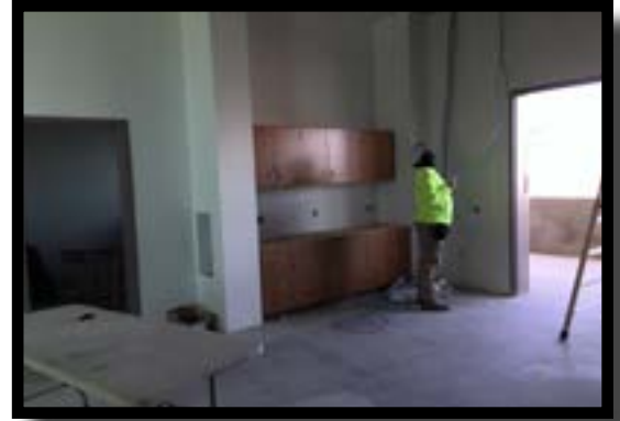
First photo, above: Wood cabinetry has been installed in the Bookstore's shipping and receiving area.