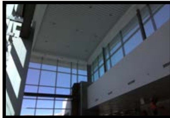
Second photo, left: High ceiling panels and lights have been installed in the student lounge area.