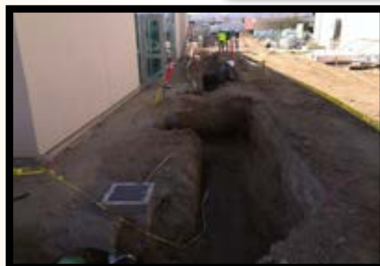
Fourth photo, left: Concrete Masonry Unit (CMU) block wall footing is being prepared.