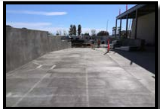
Third photo, above: Site concrete has been poured on the north side of the building.